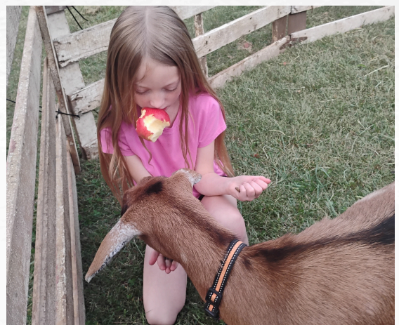
Glad he wants the feed, not the apple!