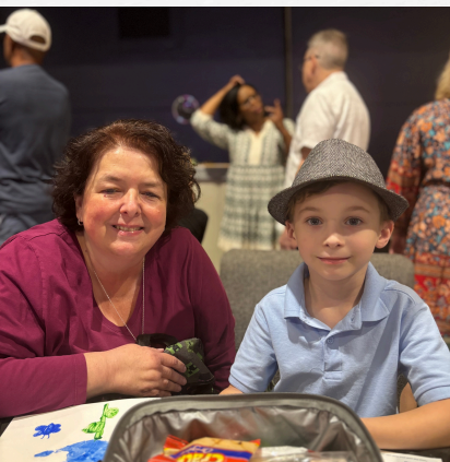
Grandparents Day Lunch