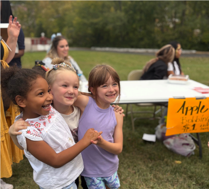
Chili Supper Fun!