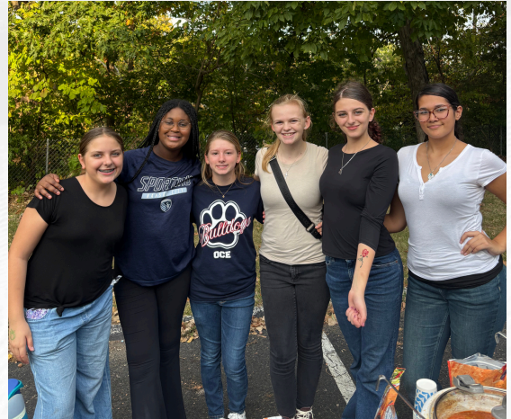
Friends for life