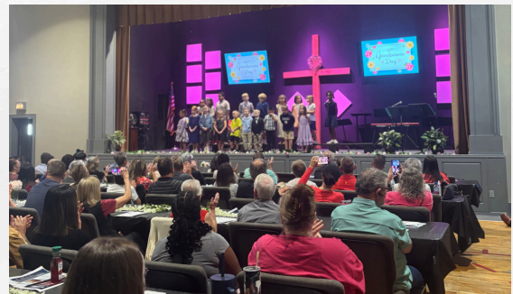
Grandparents Day Program