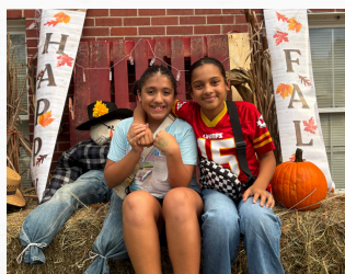
Chili Supper Pals!